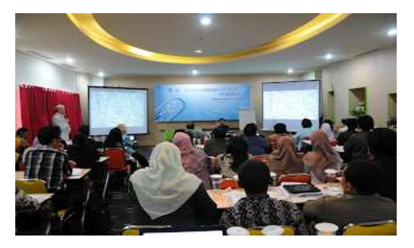
Figure 3 – classroom circumstances

The second part of the fieldwork took place in two nearby archeological complexes, the Ratu Boko 8<sup>th</sup> century extensive acropolis overviewing the Prambanan plain, and the 9<sup>th</sup> century Banyunibo Buddhist temple close by, stressing the role of geographical names standardization as a means of preserving the cultural heritage.