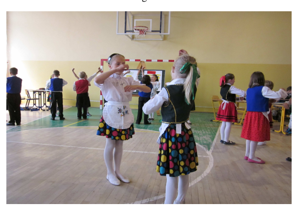
School children performing Kashubian dances Figure 4