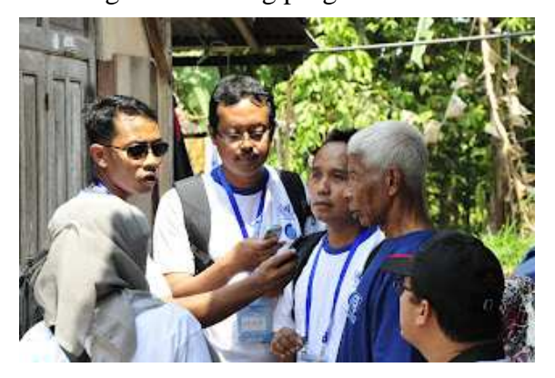
Figure 2: Fieldwork participants interviewing local inhabitants

Optimal teaching conditions, with coffee, tea and lunches provided on site (so that participants need not leave the premises) made it possible, also thanks to the extremely motivated audience, to have a exacting 9-6 lecturing program.